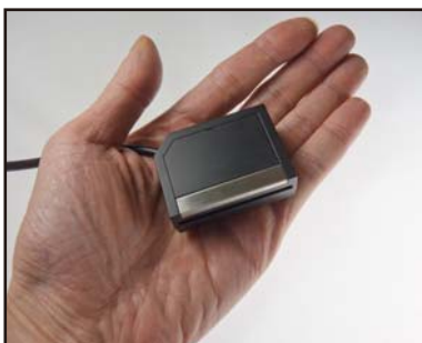
Durable and compact housing