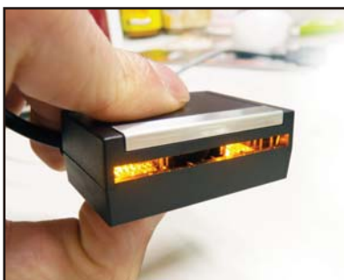
High-Speed CCD image sensor